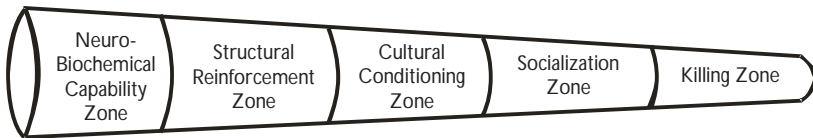
Figure 1. The Funnel of Killing

The killing zone is the place of bloodshed from homicide to mass annihilation. The socialization zone is where people learn to kill, directly by training or vicariously by observation of models for emulation. In the cultural conditioning zone we are predisposed to accept killing as unavoidable and legitimate. Among sources of conditioning are religions, political “isms,”